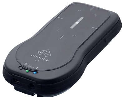
Piranha CT (455)/IC