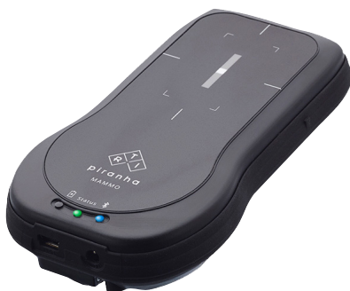
Piranha MAMMO (355)