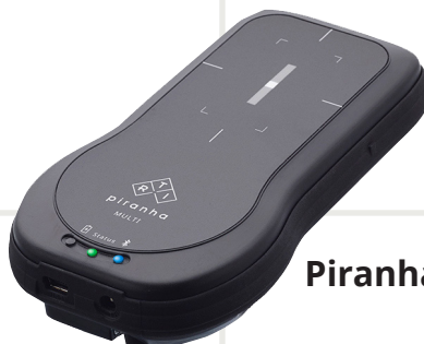
Piranha MULTI (657)